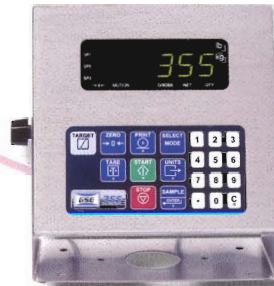
Safe Area Hub: Model 355 Indicator