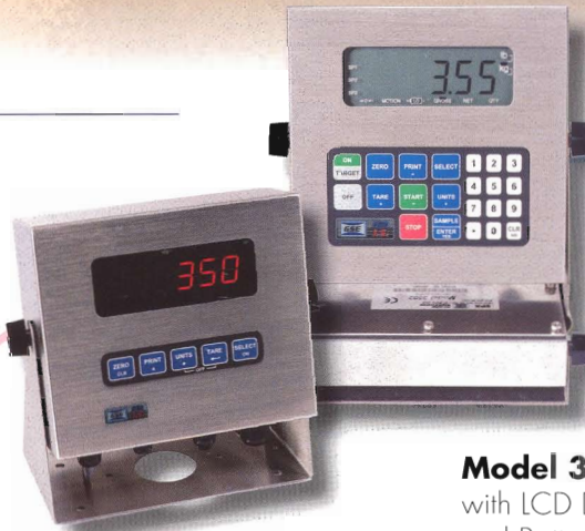
Model 355 I.S. Indicator with LCD Display, and Battery Module